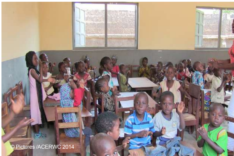
A Child-friendly space in PK 5

materials are stolen. The schools have not been rebuilt and are being occupied by armed groups particularly in rural areas. Some schools remain closed since the outbreak of the conflict. For over one million children, primary universal education is not currently secured. In some regions, children prefer to engage in gold washing activities rather than going to school due to lack of teachers and fear of the conflict and take refuge in more secure areas. The start of the school year scheduled on November 20, 2014 was not effective.