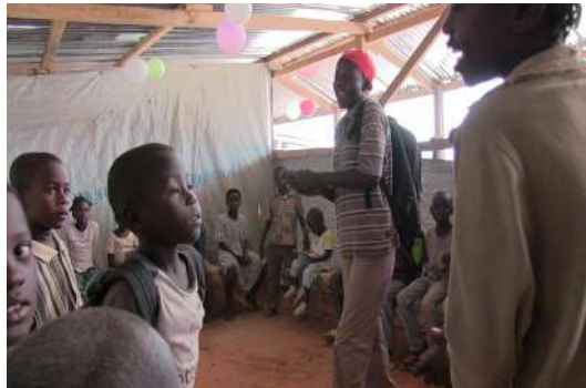
Children in th child-friendly space at the Mpoko IDPs Camp, Bangui