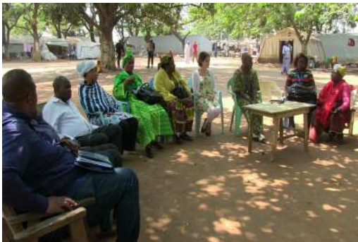
Discussion with the communities that fled to the Mosque in PK5, Bangui