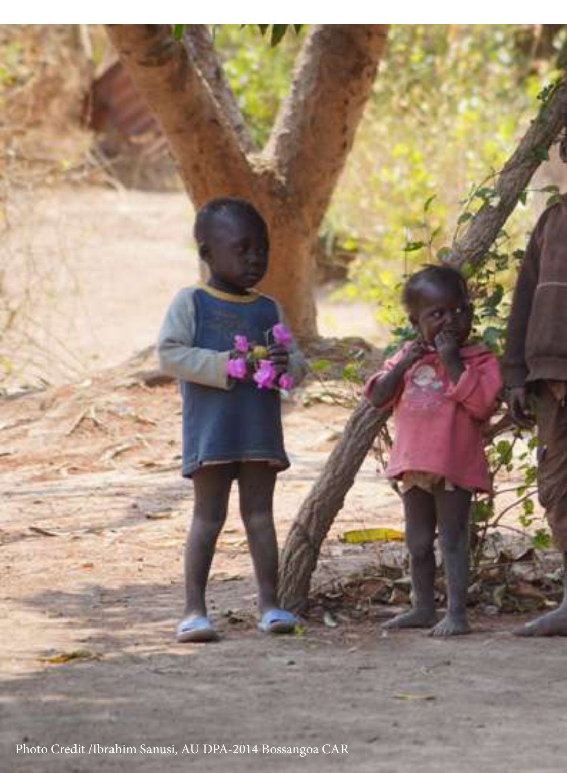
Bossangoa CAR