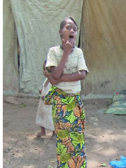
Families living in the courtyard of the Mosque in PK5